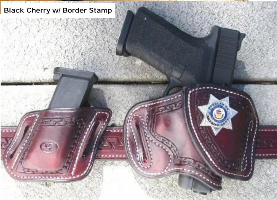
Black Cherry w/ Border Stamp