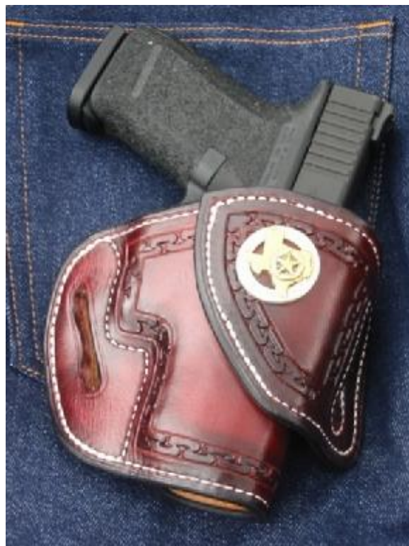
PRICED FROM $85 UP