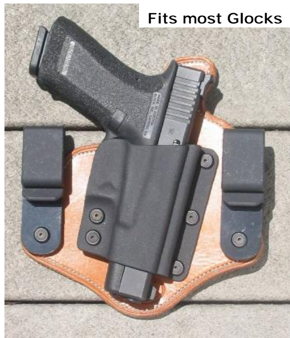
Fits most Glocks

Available now for 1911's, Glocks and most Sig Sauer's. More models to be added as demand dictates.