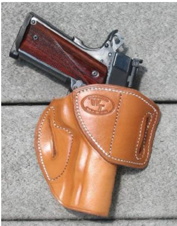
HF Series Belt Holsters IDPA Approved