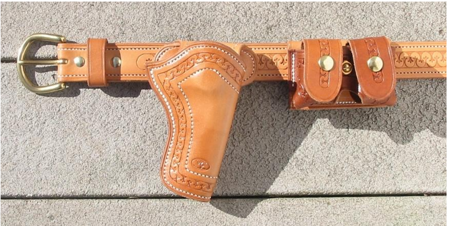
Hi-Ride Holster Rig Below made for Colt Python