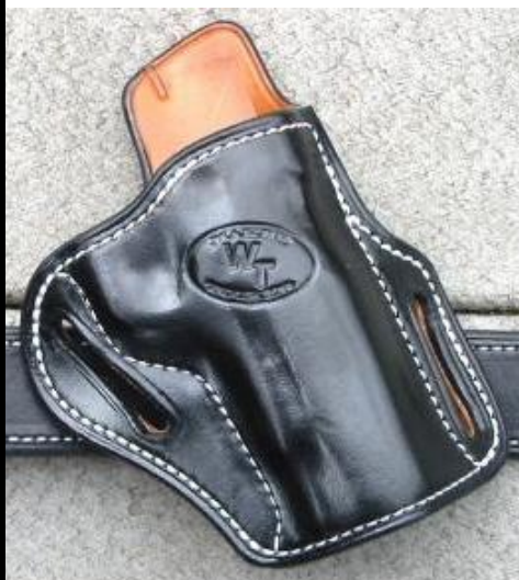
Black Cross Draw