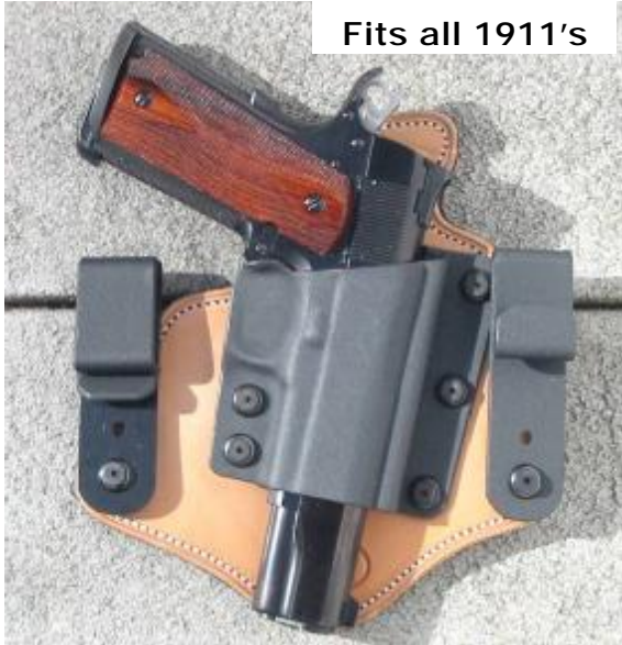
Fits all 1911's

Snapover Belt Clips or J-Hook Belt Clips