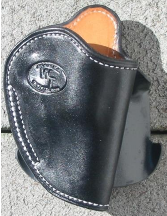
Black Paddle for Revolver