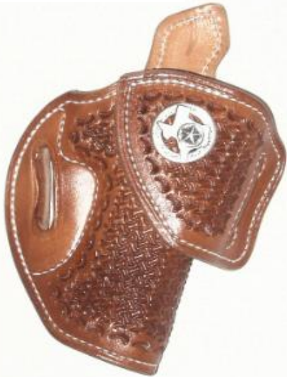
Swirl Cut - Natural