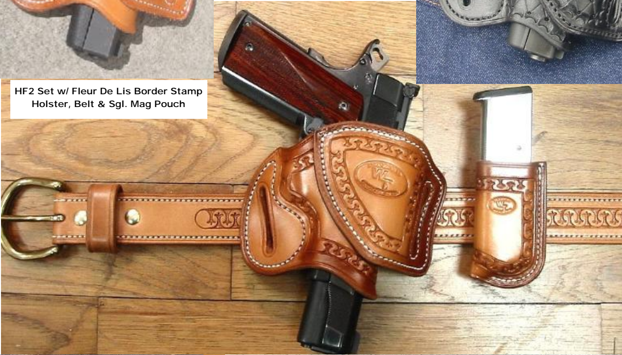
HF2 Set w/ Fleur De Lis Border Stamp Holster, Belt & Sgl. Mag Pouch