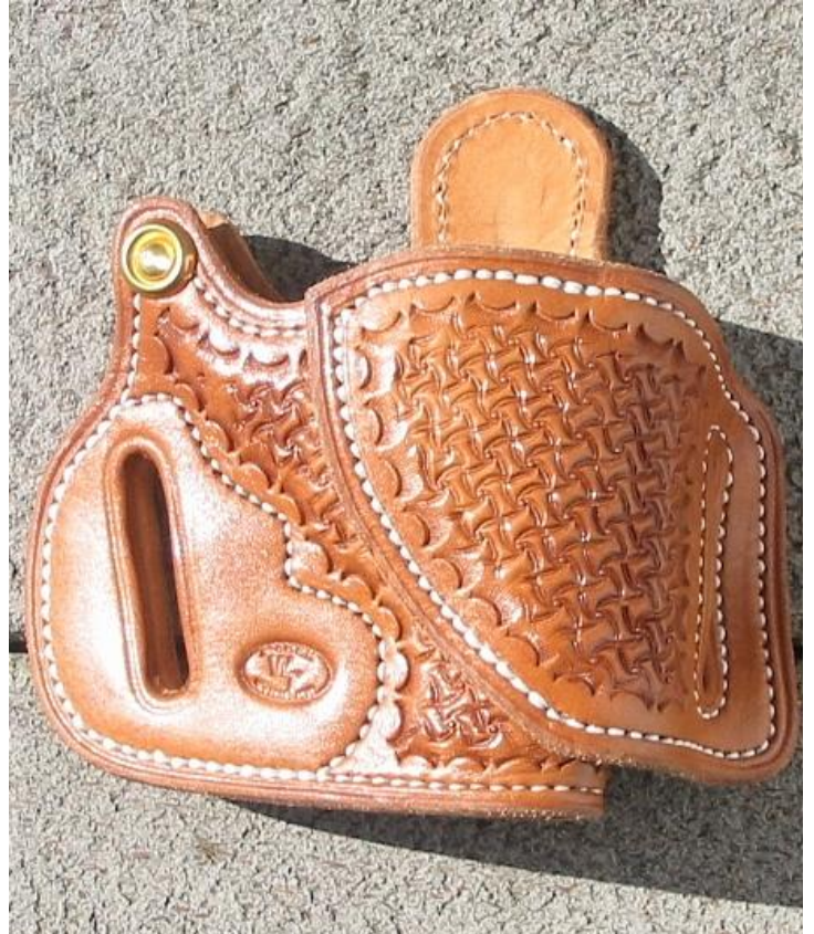
HF3 for J-Frame